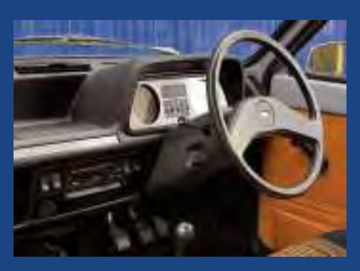
Mk1 Fiesta, 957cc, 48PS, 0 to 62 mph in 19.6sec, 35.5mpg, wheelbase: 2.286m, track 1.335m, overall length: 3.565m, width: 1.565m, weight: 730kg. From £1856 in 1977, equivalent to £14,020 in 2007 (based on average earnings)