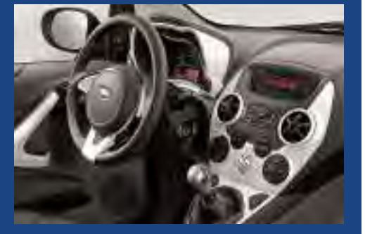
New Ka 1242cc, 69PS, 0 to 62mph 13.1sec, 55.4mpg (Combined), wheelbase: 2.3m, track 1.414m, overall length: 3.62m, width: 1.658m (exc mirrors), weight: 940kg inc driver. Five star Euro NCAP adult occupant protection, four star child occupant protection and three star pedestrian protection. From £7,995