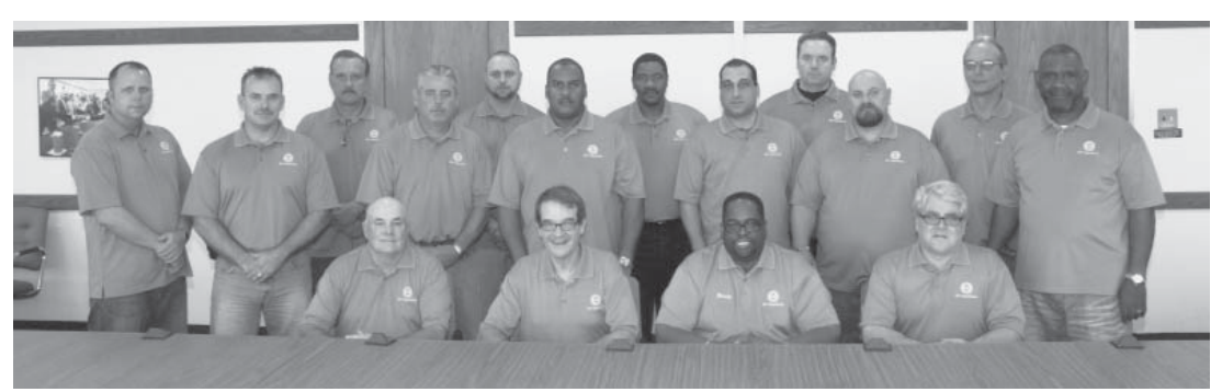
The 2011 UAW Ford National Negotiating Committee