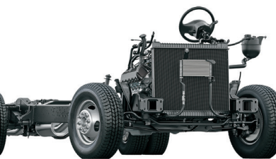
E-350/450 Stripped Chassis