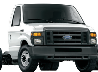
E-350/450 Cutaway Chassis