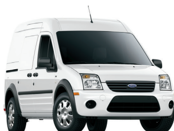
Transit Connect Van/Wagon