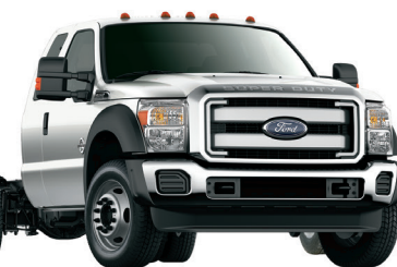
F-350/450/550 Super Duty Chassis Cab