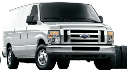
E-150/250/350 Cargo Van/Wagon