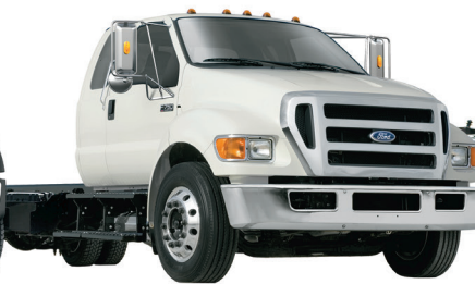
F-650/750 Medium-Duty Chassis Cab