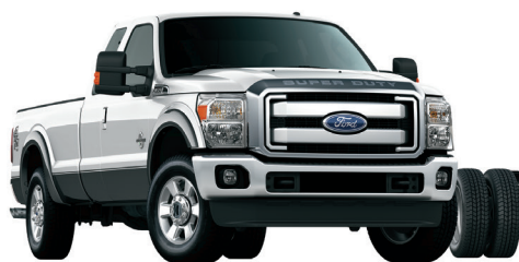
F-250/350/450 Super Duty Pickup