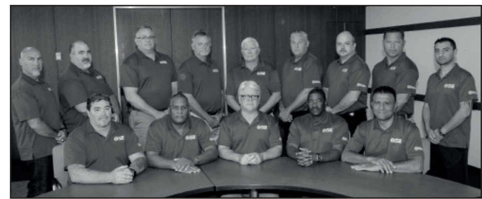
The 2019 UAW Ford Hourly National Negotiating Committee.