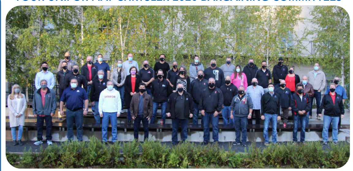
Photo taken on October 9, 2020 in compliance with COVID-19 public health measures.