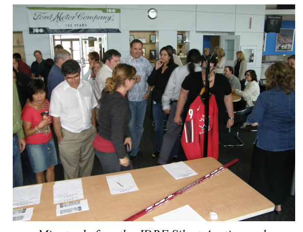
Minutes before the JDRF Silent Auction ends