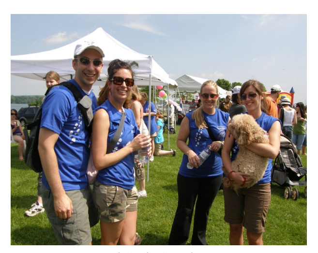
Ford Credit Canada Team