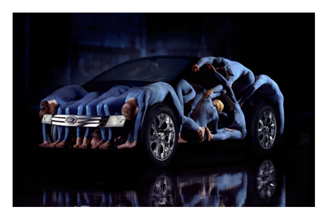
The famous Pilobolus dance troupe is part of the Powered by You primary brand campaign that focuses on the consumers

I hope that you enjoy this debut of The LINC 2.0. Let's keep in touch,