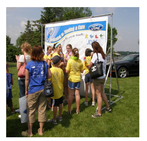
Wall of Awareness