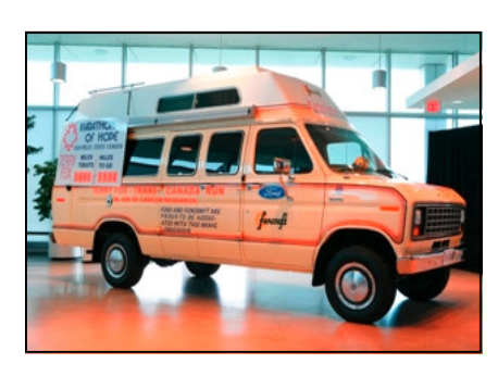
Click for story