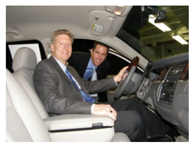
First STAP Town Car presented to St. Thomas Ford