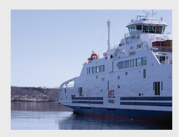
Unifor's Marine Sector calls on all levels of government and industry to fight back against U.S. tariffs.