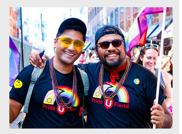
All Unifor members are invited to celebrate Pride events and stand in solidarity with 2SLGBTQIA+ communities.

Unifor's Paid Education Leave program empowers members through union-led training, building knowledge and solidarity. View the fall/winter course schedule.