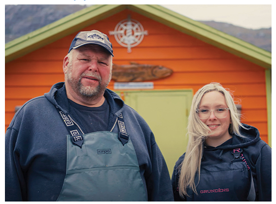
FFAW-Unifor has been recognized for its outstanding communications work, taking