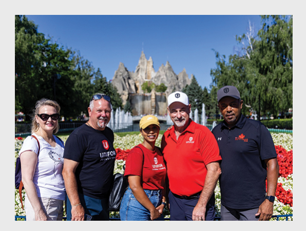
Join thousands of fellow Unifor members and their families at Canada's Wonderland for member appreciation day on July 13. Get your tickets now!