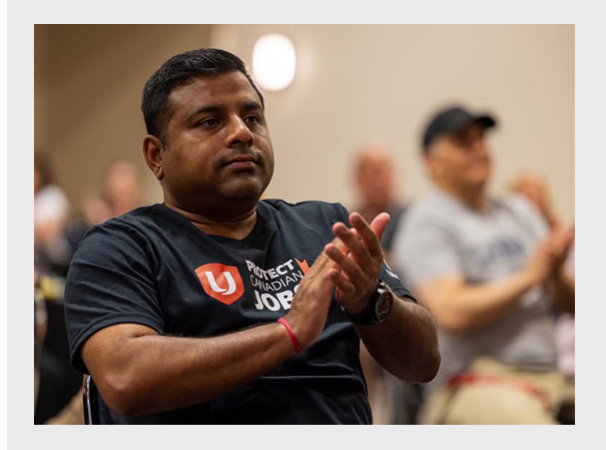
Unifor's EI/CPP Conference brings activists together to defend pensions and push for a more just social safety net for all workers.