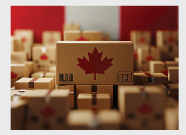
Lana Payne explains that more trade shouldn't mean less protection. Let's build